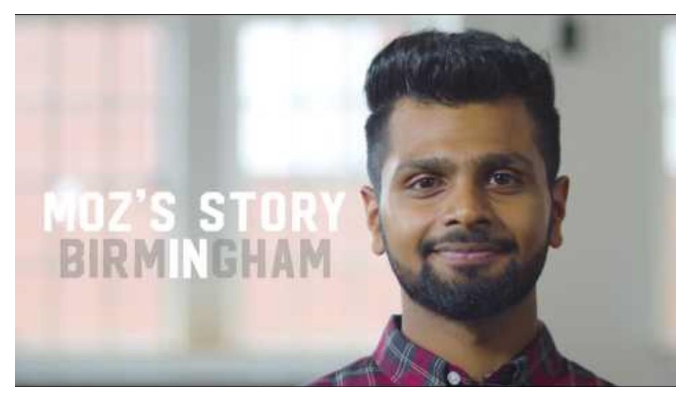
Click here to watch